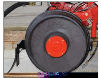
Powerful air knife increases capacities up to 50% in adverse weather.