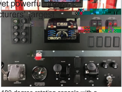
180-degree rotating console with a multifunction display. Dual four-way air suspension seats for operation from either side of cab when in rail mode.

FUEL CAPACITY 90 gallons (340.69 ltr) HYDRAULIC RESERVOIR CAPACITY50 gallons (189.27 ltr) AIR TANK CAPACITY (RAIL BRAKES 30 gallons (113.56 ltr) AIR TANK CAPACITY (VEHICLE BRAKES)gallons (39.74 ltr) AIR FILTER Dry replacement element OIL & FUEL FILTERS Replacement element WHEEL BASE 92" (2337 mm) WIDTH 120" (3048 mm) 130.5" (3327 mm) HEIGHT 242" (6147 mm) LENGTH GROUND CLEARANCE 101/2"(266.7 mm) WEIGHT 46,000 lbs (20,870 kg) FIRST GEAR 0 to 3mph/4.8kmh SECOND GEAR 0 to 7mph/11.2kmh THIRD GEAR 0 to 12mph/27.3km/h