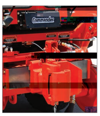
Wide range AAR sliding couplers are air released and hydraulically positioned to improve pulling performance on curves and grades.