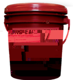
Extremely effective slug treatment for bores experiencing extreme "frack outs"