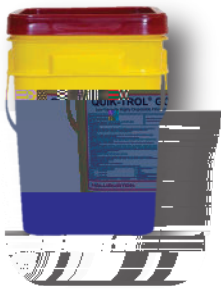
Increase filtration control & hold bore open in multiple soil types.