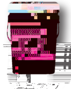
Keeps clay off of tooling.