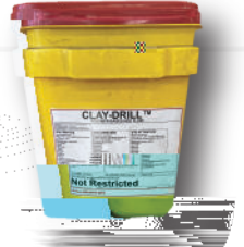
A single sack product designed for smaller clay bores.