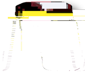
A clay stabilizer to reduce the sticking tendencies of clay.