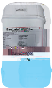
A lubricant that adheres to the metal surfaces & reduces drag on tooling.