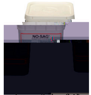
Increase the bore fluid's ability to suspend & carry out cuttings in sand.